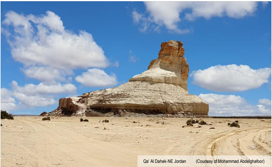
Qa' Al Dahek-NE Jordan

Conference E-mail: jo-geoconf11@jga.org.jo